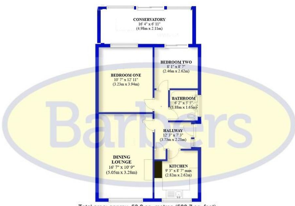
Total area: approx. 53.9 sq. metres (580.7 sq. feet) Plus the Conservatory

We accept no responsibility for any mistake or inaccuracy contained within the floorplan. The floorplan is provided as a guide only and should be taken as an illustration only. The measurements, contents and positioning are approximations only and provided as a guidance tool and not an exact replication of the property. Plan produced using PlanUp.