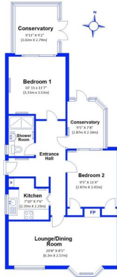
Total area: approx. 74.0 sq. metres (796.6 sq. feet)

This floor plan has been prepared for the exclusive use of Barbers Estate Agents. All due care has been taken in the preparation of this floor plan which should be used for illustrative purposes only. All sizes and dimensions of rooms and walls are approximate. The positioning of windows, doors, openings, fixtures and fittings are approximate and for use as a guide only. This floor plan is not, nor should it be taken as, a true and exact representation of the subject property. Plan produced using PlanCAD.